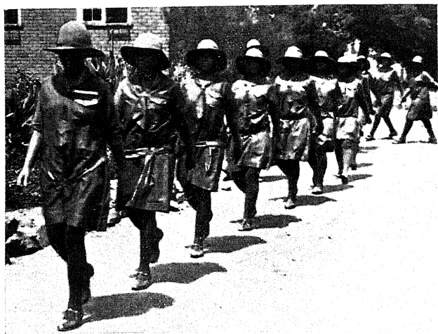
SOME WAYFARERS (NATIVE GIRL GUIDES) (Chapter VII.)